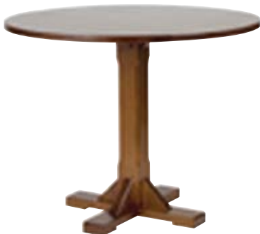
Horsham Pedestal Base

The Nuthurst is also available as a Bar High Base