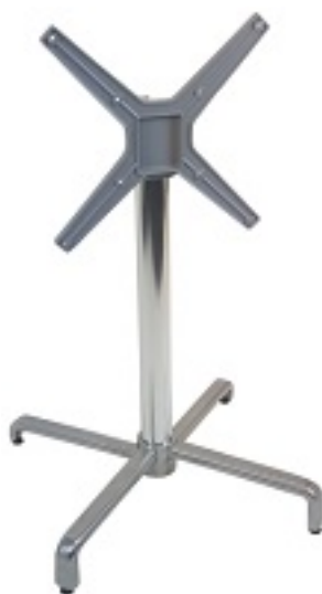
Oldwood Flip Top Base