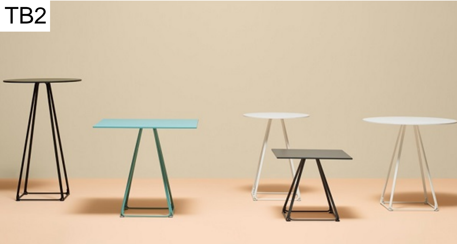
Lunar Table Base Range