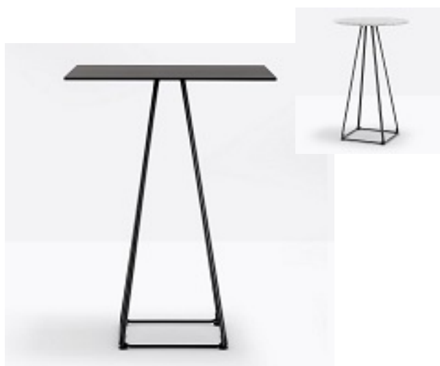
Lunar Bar Height