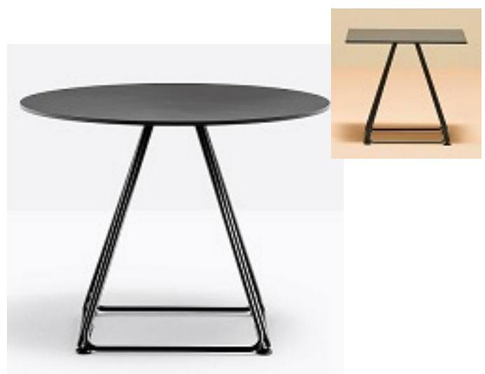
Lunar Coffee Height