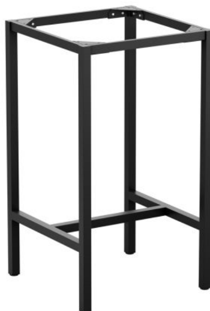
Droitwich Base Range

Available in 60, 70 and 80cm Square and 120x80cm Rectangular in dining height. 60, 70 and 80cm Square in bar height. All finished in Black Available in Aluminium for exterior use and powder coated steel for internal use