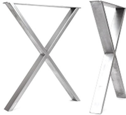
Double Cross Base

Available in Standard Dining, Large Dining and Bench Height