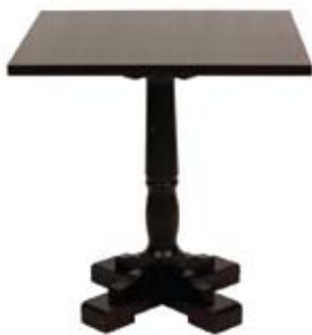
Nuthurst Regular Pedestal Base

Available to suit any size top in circular, square and rectangular