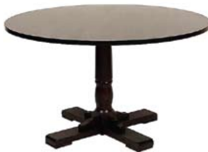
Nuthurst Large Pedestal Base