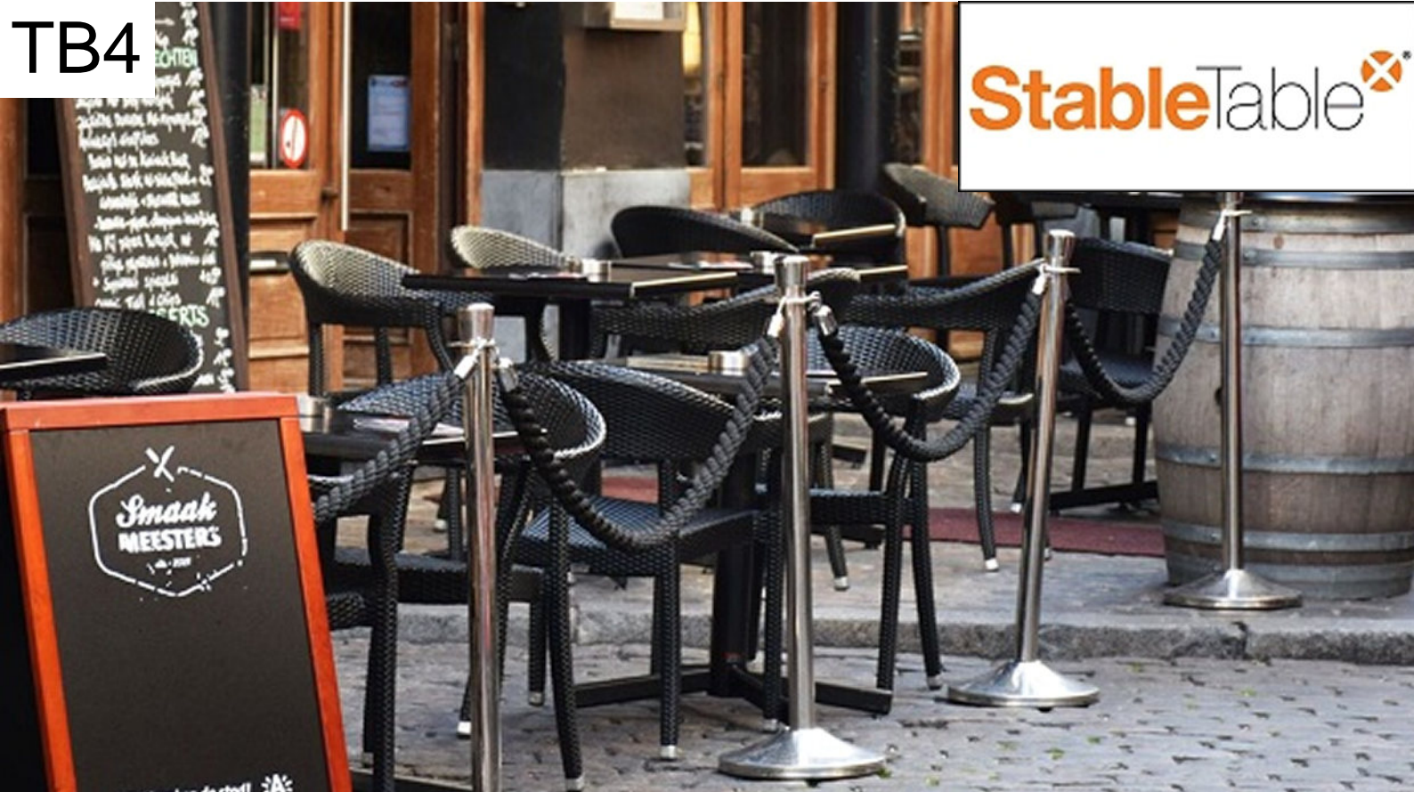
StableTable Classic And Extreme Base Range