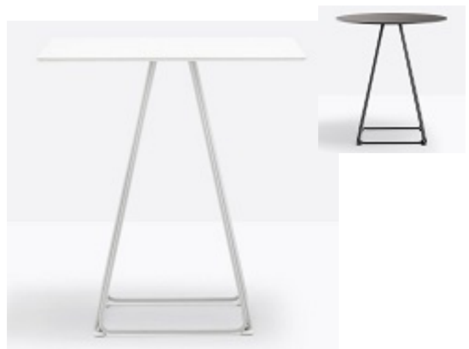
Lunar Dining Height