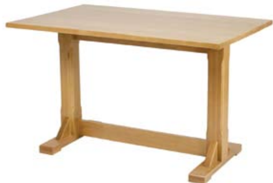
Horsham Rectangular Base

Available as regular, large and bar in any finish