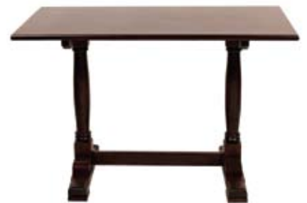
Nuthurst Rectangular Base